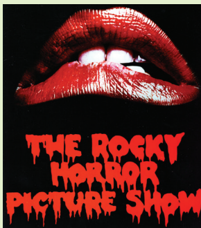
Tickets $15 - Includes Props