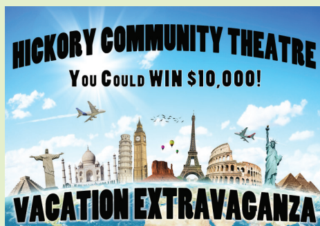
Mon • June 10 2024 • 6:30PM